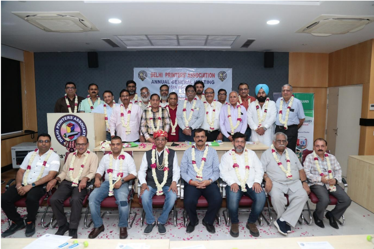
New Team of Delhi Printers' Association for the Term 2023-2024