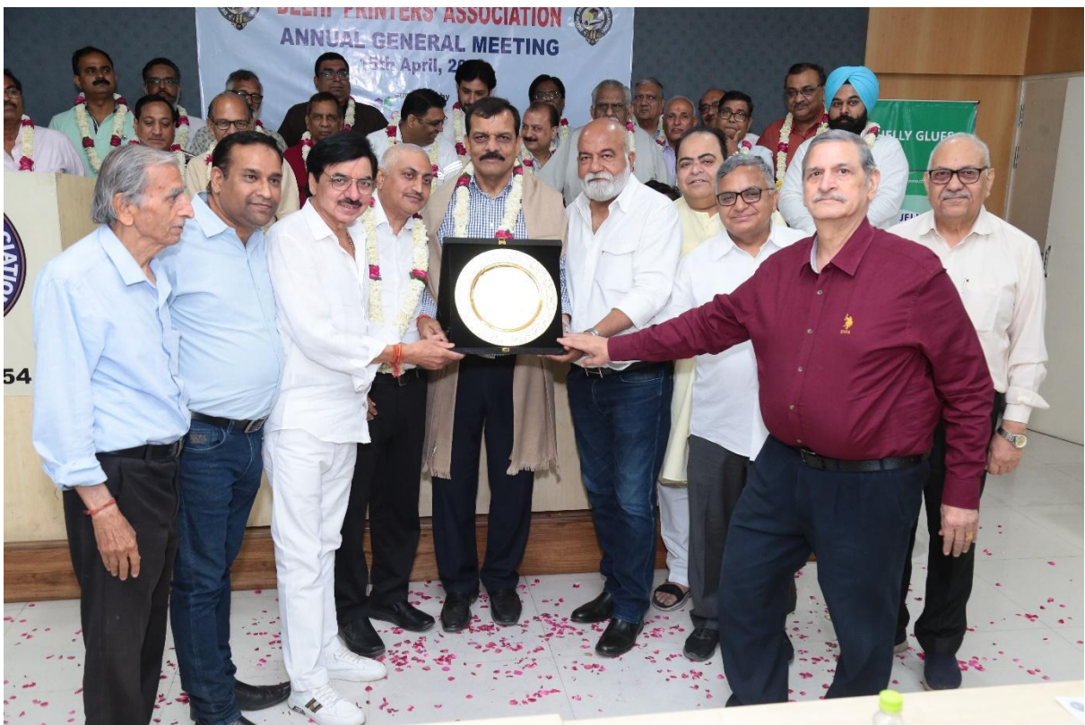
Outgoing President being Presented with Memento & Shawl