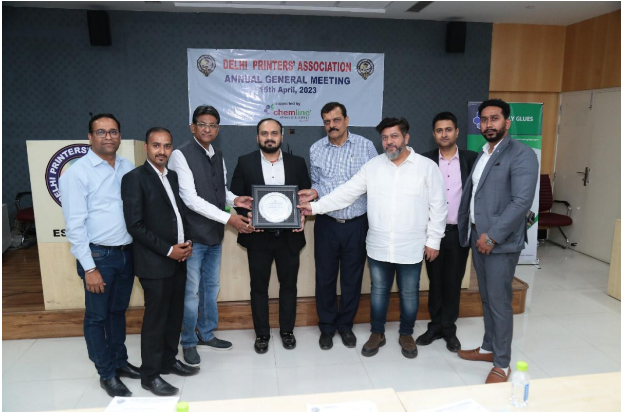
Presenting Memento to Chemline India Limited